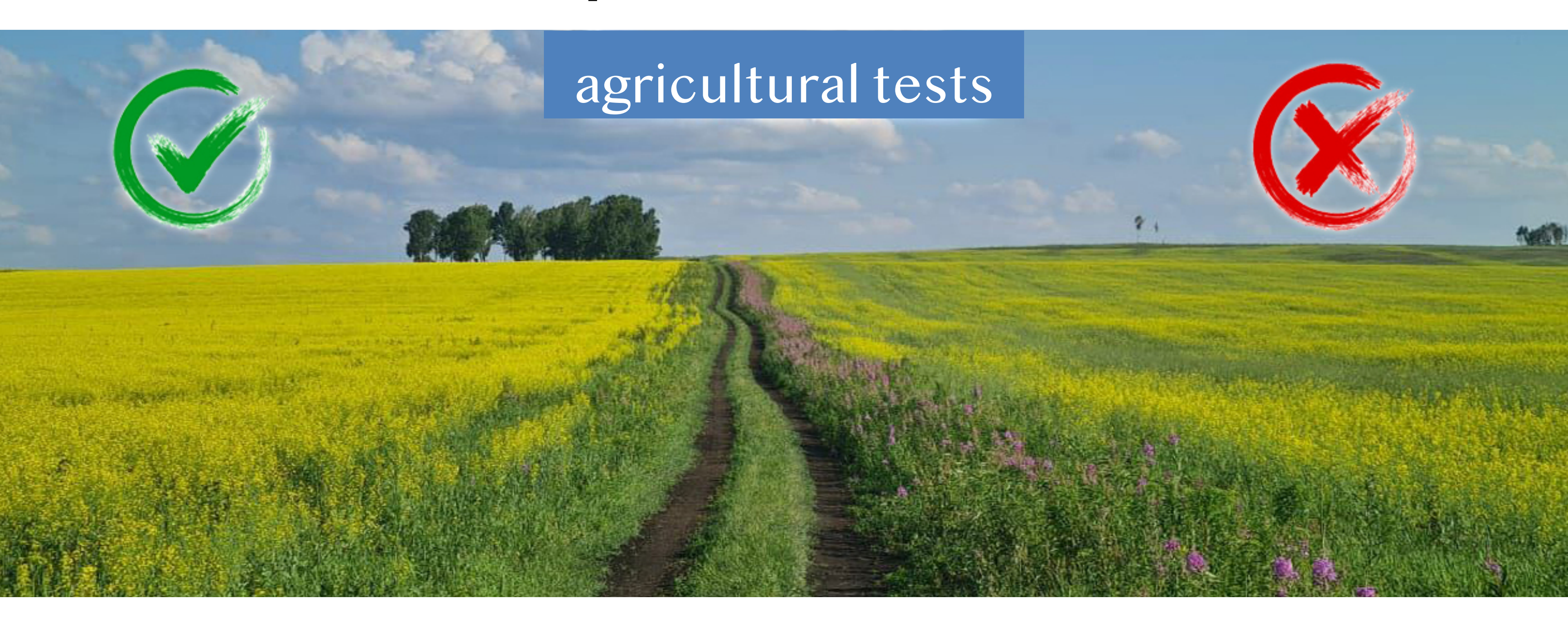
+%40 productivity +%17 oil contents